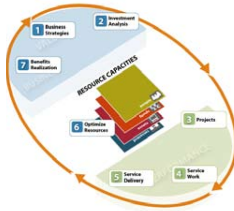
Key Process Areas for Comprehensive IT Management

The flexibility of PRISMS allows you to commit to continuous process improvement by moving to additional process areas when the return justifies the investment. In the interim, you can monitor the specific process steps you’re considering for deployment.